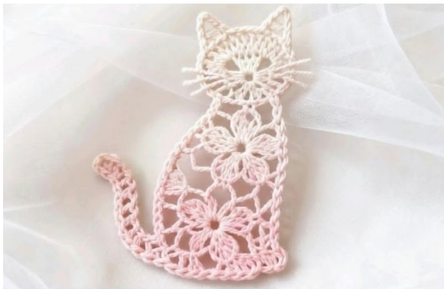
Photo & stitch diagram supplied by user — English pattern with step-by-step instructions